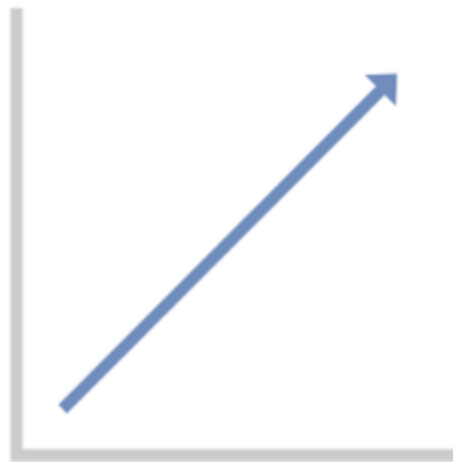
Health & performance